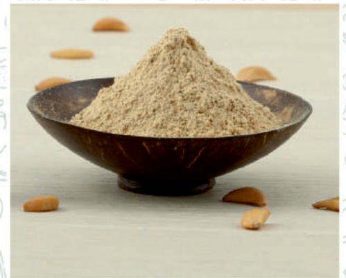
Dehydrated Garlic Powder