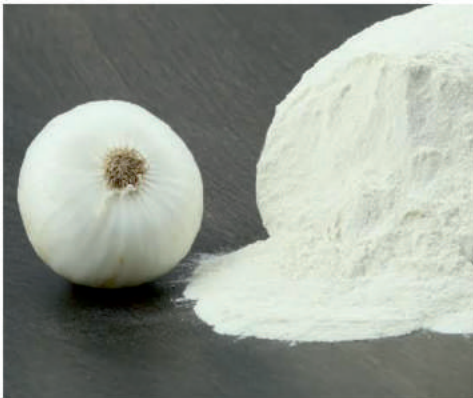
Dehydrated White Onion Powder