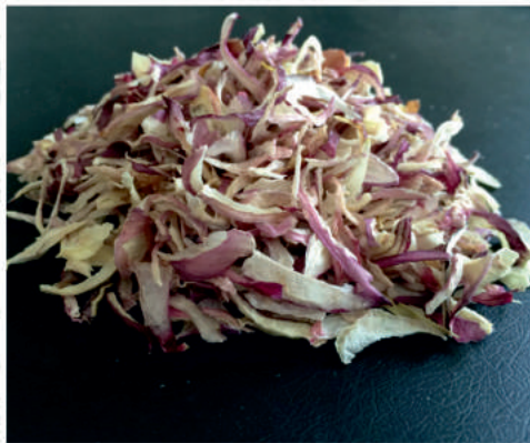
Dehydrated Red Onion Minced