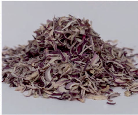
Dehydrated Red Onion Kibbled