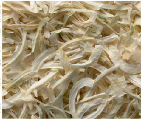
Dehydrated White Onion Flakes