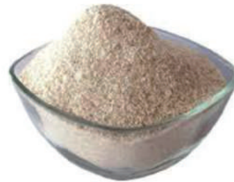
Dehydrated White Onion Granules