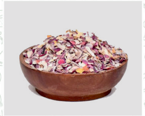
Dehydrated Red Onion Chopped