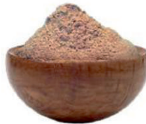
Fried Onion Powder