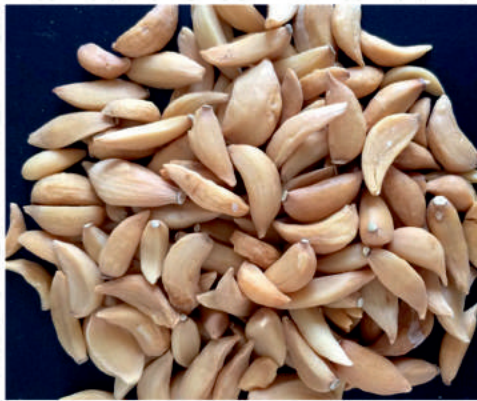
Dehydrated Garlic Cloves