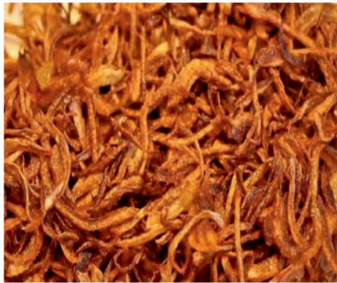
Dehydrated Fried Onion