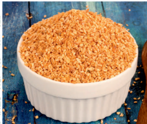
Dehydrated Garlic Granules