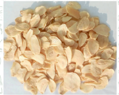
Dehydrated Garlic Flakes