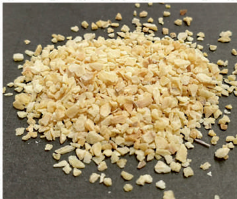
Dehydrated Garlic Minced