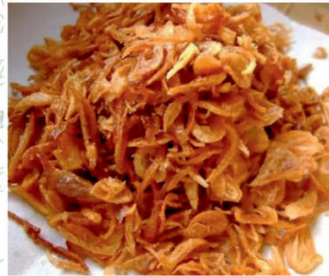
Fresh Fried Onion