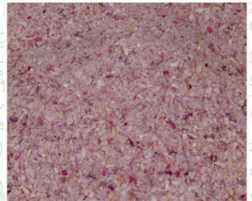
Dehydrated Red Onion Granules