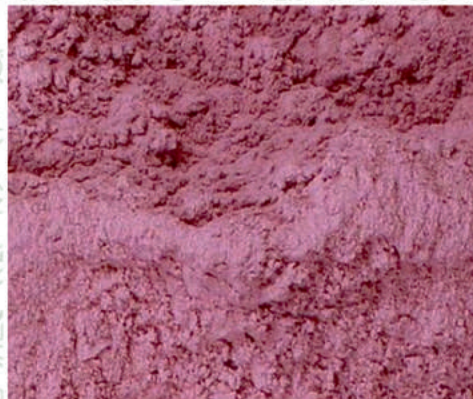
Dehydrated Red Onion Powder