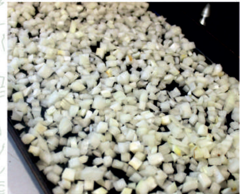
Dehydrated White Onion Minced